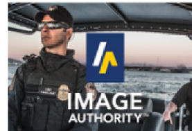
Image Authority: Design platform for uniform customization and embroidery.

CriteCore Protection Wear: High-tech uniforms for clean room environments and medical and laboratory fields.